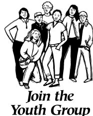
Join the Youth Group