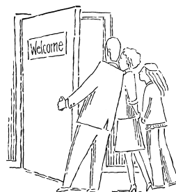
New Member Class

We will be having a Newcomer Gathering on Sunday, March 14 following the 10:00 service. If you are new to our church or are interested in joining as a member, this gathering is for you. We welcome your questions about our community of faith, programming and future