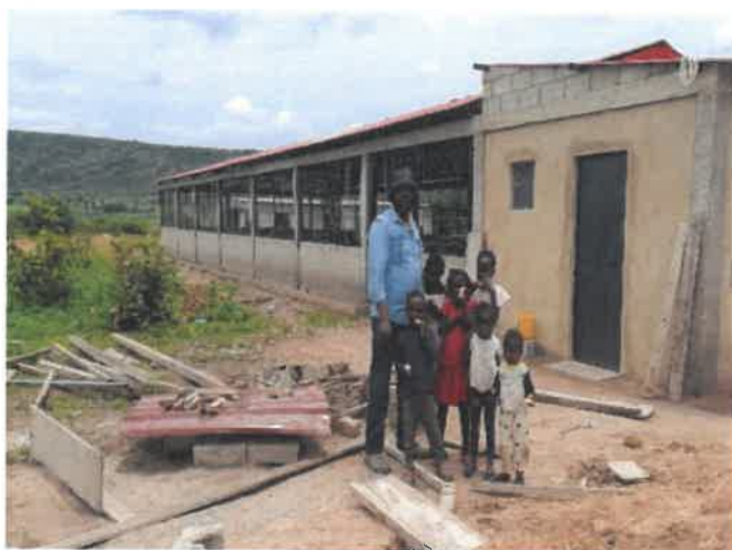
(The new piggery. Kutela with farmworker children)

The Quessua farm is expanding the production of pigs. We have recently finished construction of a piggery with capacity for 18 stalls for female pigs and we are expecting to receive the pigs by the end of February. The community we serve will be put into groups for those wanting to rear pigs and will be given a couple of piglets to start with. We will encourage the community to share their production with others.